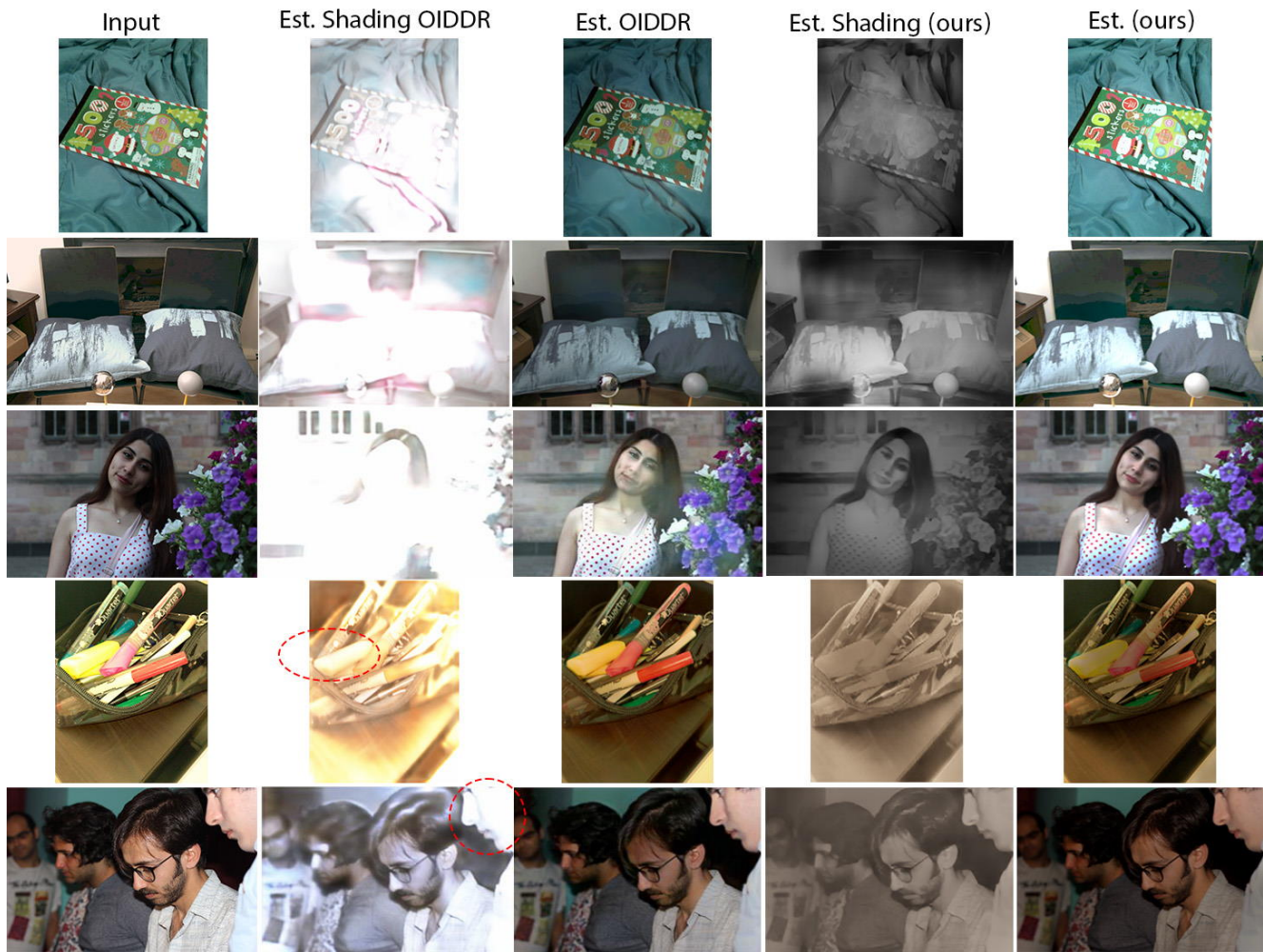
Figure 2. Comparison between our method to OIHDR [6]'s in generation task (row one to three) and decomposition task (row four and five) for both the shading and final illumination. Row three and five are not from our test set.