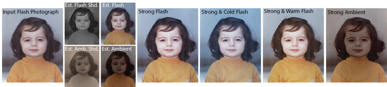
Figure 3. The separate flash and ambient shadings we estimate for a given flash photograph can be edited separately to render the same scene under varying illuminations.